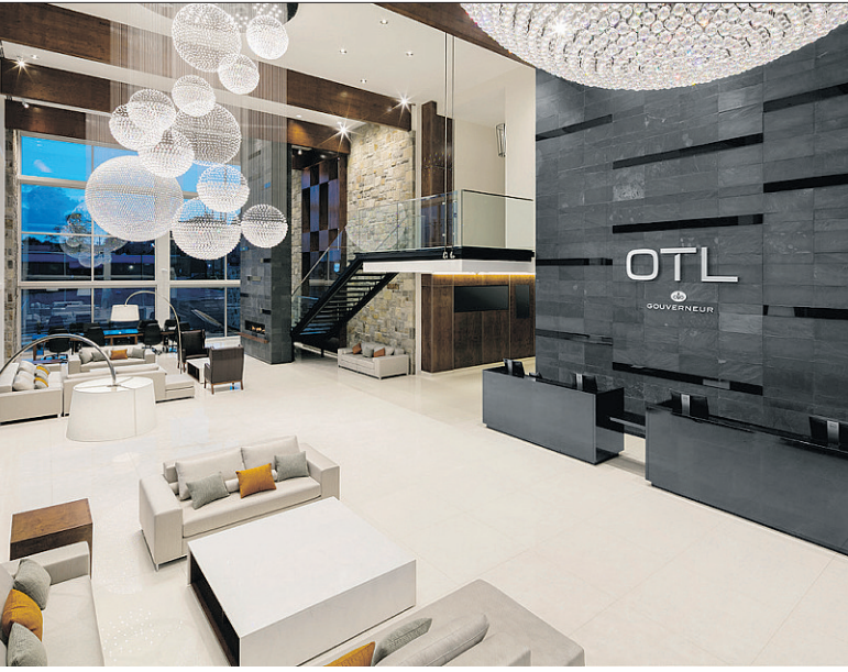
The first of the new OTL Gouverneur brand has a dazzling interior decor and deluxe guest rooms. OTL GOUVERNEUR SHERBROOKE

The gym is a state-of-the art space. There are TVs, sure, but the Matrix cardio machines